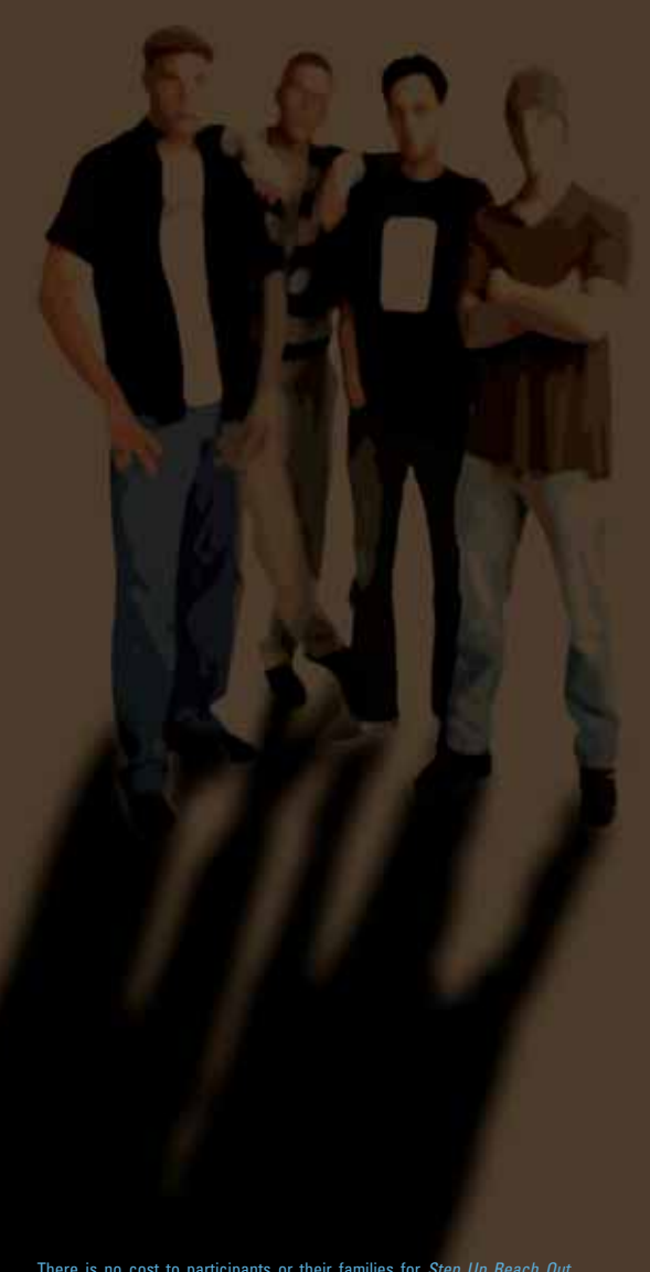
There is no cost to participants or their families for Step Up Reach Out travel, accommodation or program expenses.